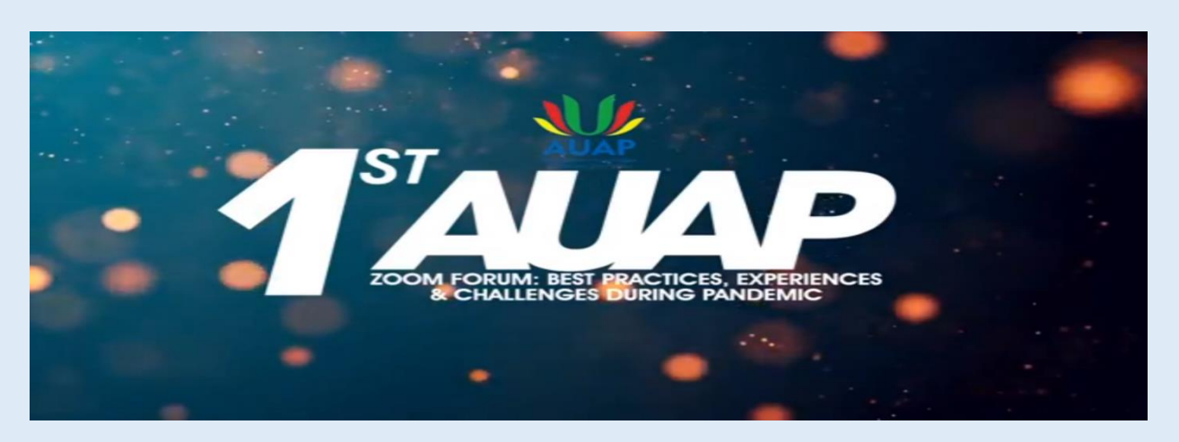
"Managing Covid-19 Pandemic: Experiences, Challenges and Best Practices" on April 30, 2021 at 2.30 pm., Manila time, Philippines.

The Association of Universities of Asia and the Pacific (AUAP) in conjunction with Lyceum of the Philippines University – Batangas (LPU-B), organized the First Series of AUAP Zoom Forum entitled "Managing Covid-19 Pandemic: Experience, Challenges, and Best Practices" on 30 April 2021, at 14:30, Manila time, Philippines.