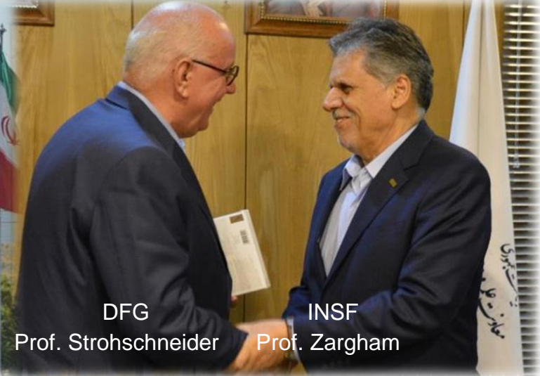
DFG Prof. Strohschneider